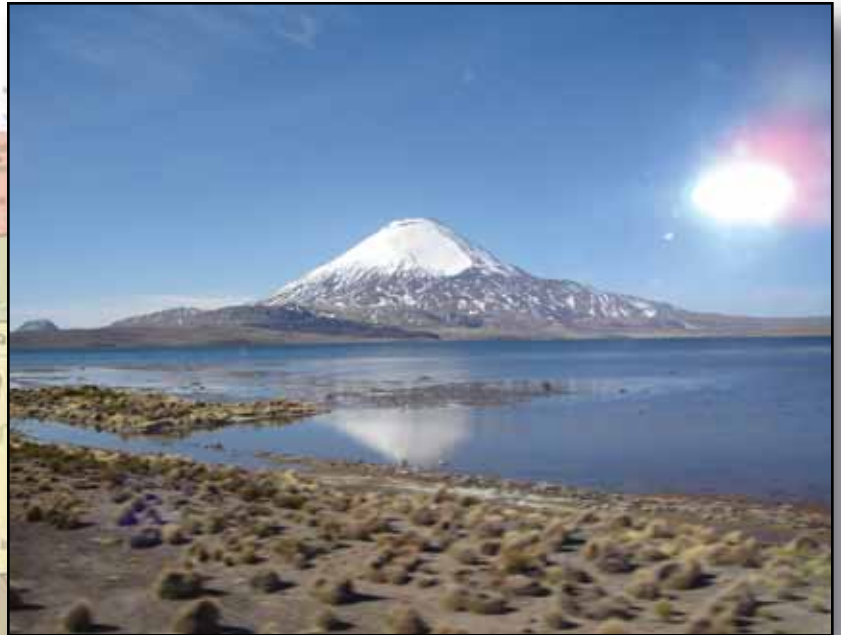
Lake Chungará and Parícuta volcano in northern Chile near the Bolivian border.