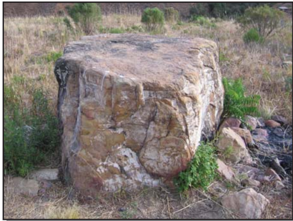
Human sacrifices were once offered on this stone altar.